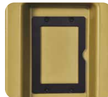
A6 Name Plate