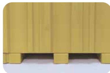
Forklift Skids & Risers