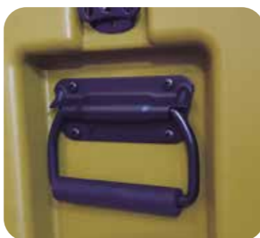
Stainles Steel Handle