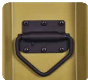
Stainles Steel Tie - Down Rings