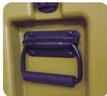
Stainless Steel Handle