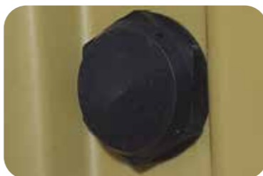
Membrane Valve (Standard)