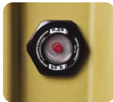
Mechanical (PRV) Pressure Valve

Options are stainless steel handles, mechanical valve, hinged lid, humidity indicator, desicant port, stainless steel tie-down ring, document holder, forklift skids, riser & caster set, lockable catch, lockable wire catch, A6 and A7 size card holders, wheels.