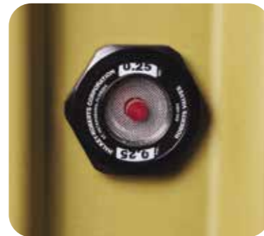
Mechanical Pressure Relief Valve (Standard)

Options are membrane valve, stainless steel handles, humidity indicator, stainless steel tie-down ring, riser & caster set, lockable catch, lockable wire catch, A6 and A7 size card holders, wheels, document pouch and coupling strap.