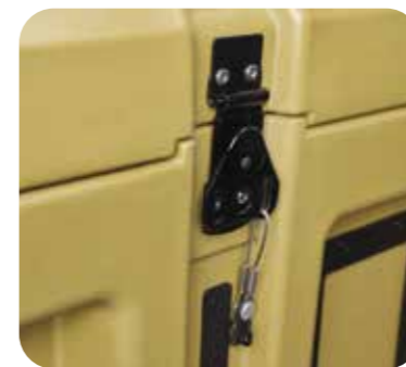
Lockable Wire Catch