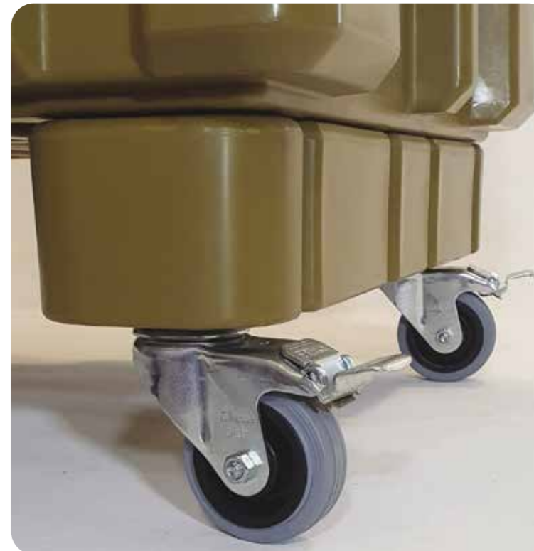
Riser & Caster