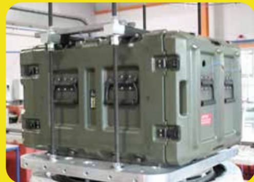
Vertical Shock Rack