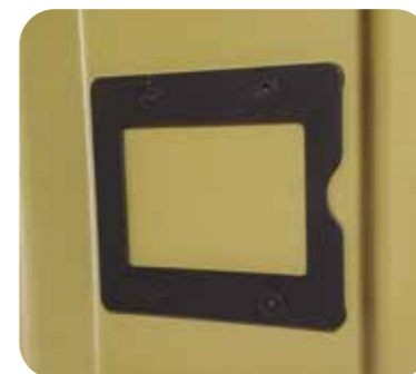
A7 Name Plate