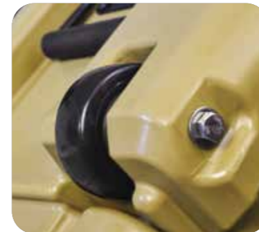
Wheels (Standard on 12T Models)