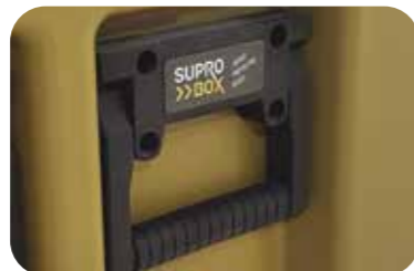
Plastic Handle (Standard)