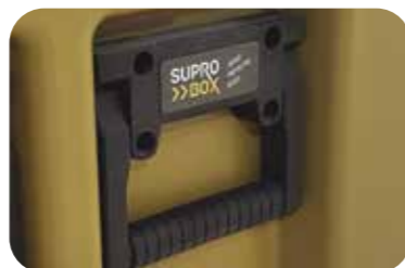
Plastic Handle (Standard)